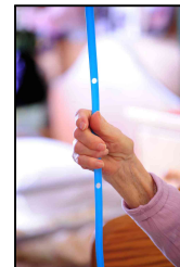
Ergonomic design is easy to see and grab

Please Note: Consult the SuperSanipull Bulk Premium Price Matrix if you need additional ribbon (1000' spools, 360' spools or 120' coils) or SuperSanipull clips or grab handles