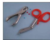
1/4" medium duty single-hole hand punch and bandage scissors make installation easy