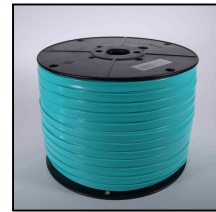
1000' spools of Sanipull ribbon